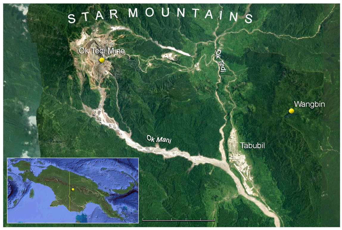
Fig. 1. Satellite map (derived from Google Earth) of the southern Star Mountains, North Fly District, Western Province, Papua New Guinea, with yellow dots on the larger map indicating two localities (Wangbin and Ok Tedi Mine), approximately 13 km apart, where Toxicocalamus ernstmayri has been recorded. The main town is Tabubil at the confluence of the Ok Tedi and Ok Mani, which flow into the Fly River. Scale = 5 km. The inset map illustrates the location of the larger map in relationship to the rest of New Guinea.

2015, as it crawled across an area of active mine workings along the west wall at the Ok Tedi Mine (5°12'53.77"S, 141°08'38.57"E, elev. 1,670 m) approximately 13.2 km WNW of Wangbin, in the North Fly District where the holotype was collected (Fig. 1). It was observed for approximately 20 min and photographed several times.