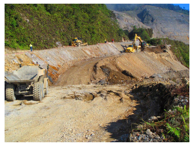
Fig. 3. View of an actively worked area of the Ok Tedi Mine. The observed individual of Toxicocalamus ernstmayri eventually disappeared into the vegetation on the slope in the top left of the photograph.

lation center, the town of Tabubil which was established to support the mine, yet the mine lies over 1.2 km higher. Tabubil, located at only 457 m elevation, is approximately 450 km from the coast. The steepness of the southern Star Mountains, rising by 1,200 m in elevation over only 12 km in horizontal distance, contrasts with the almost imperceptible south-north increase in elevation (< 500 m over 450 km) of the Trans-Fly Region as a whole.