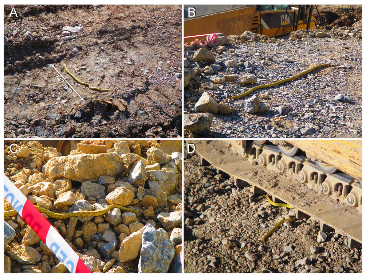
Fig. 2. The first live individual of Toxicocalamus ernstmayri , observed and photographed in broad daylight at the Ok Tedi Mine, North Fly District, Western Province, Papua New Guinea. (A) The individual's serendipitous crossing of a 747 mm wide tire track allowed an approximation of its total length as near 850 mm. (B) The snake moves in a straight line across open ground. (C) Slower movement across a rubble pile allowed a more detailed examination of head and body scales (see Fig. 4). (D) The individual moving under the tracks of a stationary digger.

body. At an SVL > 750 mm total length this individual of T. ernstmayri would appear to be a subadult, as it is considerably shorter than the holotype (SVL 1,200 mm). The encounter with an unusual, "golden" snake at the Ok Tedi Mine was sufficiently noteworthy, even in Papua New Guinea where snake encounters are commonplace, that it was presented in the mine's own magazine ( Ok Tedi Weng magazine, Issue 1, 2017, p. 6).